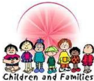
Children and Families

Pray & Play connects women, mothers, and children to God, each other, and their communities. Moms and their kids play and learn together while being encouraged through an inspirational and easy-to-follow devotional guide.